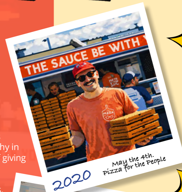
2020 May the 4th. Pizza for the People